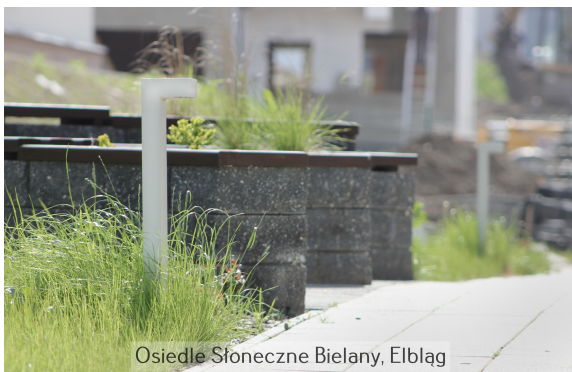
Osiedle Słoneczne Bielany, Elbląg